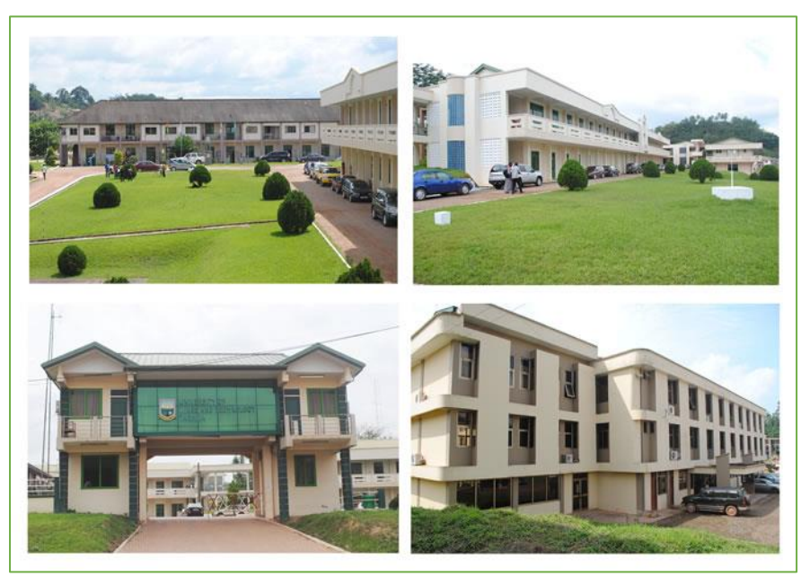
UMAT – MAIN CAMPUS IN TARKWA

Under the aegis of ParisTech, I am pleased to announce the online scientific workshop on "Geosciences" on Wednesday 26th May 2021 between UMaT and Research Department of MINES-ParisTech.